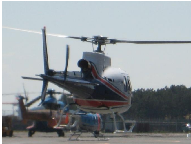
AMDA's disaster headquarters in Minami Sanrikucho