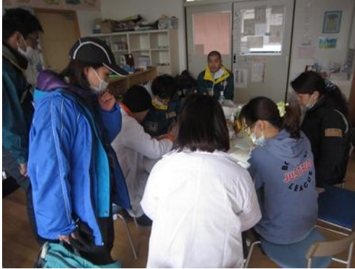
Handing over the medical records to the local doctors