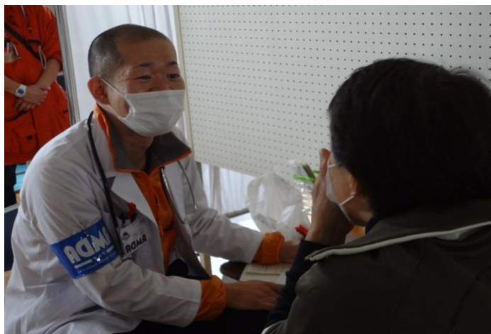
Mobile clinic at Shizukawa Elementary School