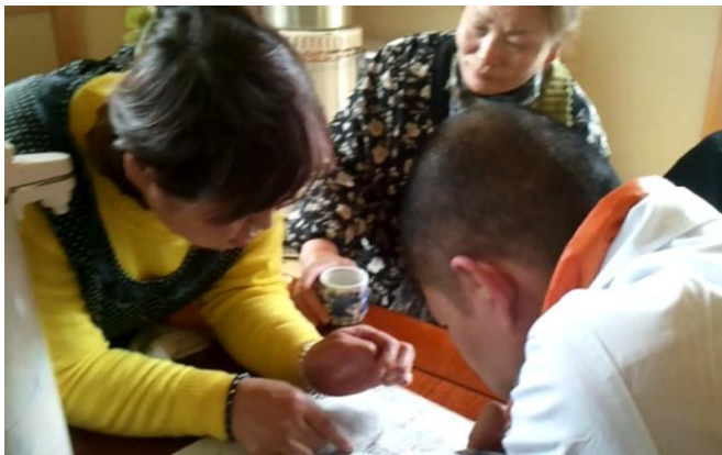
Listening to the patients